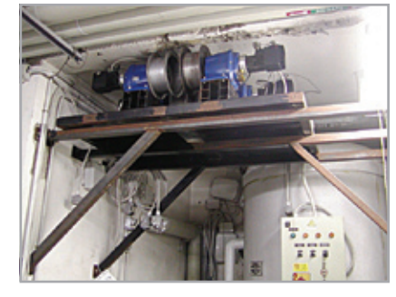
Two of the installed MAC800 motors

In their use of JVL's MAC800s, the constructors emphasised the major advantages as decentralisation of