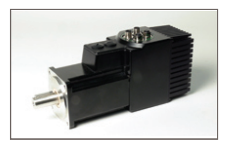
The motor in the picture is furthermore equipped with a brake.

has been achieved by replacing the ventilator built into the cooling fins with large fins. In addition, a watertight seal of the axle bearing has been achieved using an IP67 Rulon® Teflon bush. This has very low friction and requires no lubrication. The flange and shaft are made of stainless steel. Note that the expansion module used must also fulfil IP65 requirements.